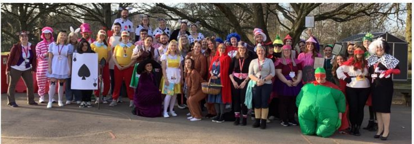
World Book Day 2025