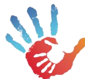
Hearsall Community Academy