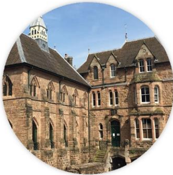
Image of Old Blue Coat School

Blue Coat Church of England School and Music College is a vibrant and inclusive large comprehensive school in the heart of Coventry. Blue Coat is a Church of England School and this identity is of great significance to us. Our vision is about 'living life in all its fullness' and we aim to provide excellent education which is distinctively Christian yet inclusive of all.